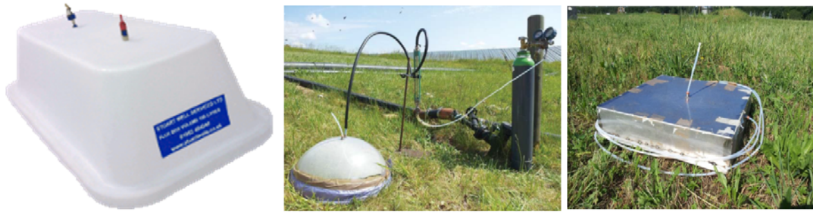
Figure 2: Examples of a static hood (left), a flux chamber (centre) and a device that can be operated both as static hood and flux chamber (right) for sampling on landfill surfaces

The first option involves the use of a flux chamber, as suggested for instance by the US EPA (Capelli et al., 2014; Klenbusch, 1986), at the outlet of which the odour sample can be collected. The second possibility, which is generally preferred for logistical reasons, as it doesn't require the use of a dedicated air tank for the sweep air supply, is a static hood. The hood should allow the LFG to diffuse in the internal volume undisturbed (i.e. no external flow) making it possible to measure the methane concentration over time and then estimate the LFG emission flux. There are several possibilities for the static hood design, as there are different proposals found for instance in the UK guidelines and in recent scientific papers (Rachor et al., 2013; Lucernoni et al., 2016). The drawback of the static hood is that, due to its limited volume, it doesn't allow the withdrawal of a 6 L bag for olfactometric analysis, and thus the direct assessment of the odour emissions on the landfill surface. It is possible to measure the methane concentration inside the chamber by means of a FID, which shall then be related to the LFG odour concentration in order to evaluate the OER. An example of these sampling devices is presented in Figure 2.