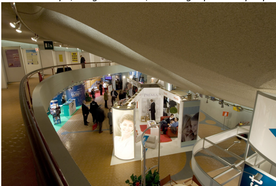
View of possible booth layout in the exhibition area.

Area: 920 sqm, Height: 2.50 m, Catering: up to 700 people