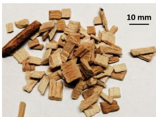
a) The initial sample of wood chips.

Beech chips with moistures 0.50 \pm 0.03 % wt. dry mass, 7.50 \pm 0.01 % wt. dry mass, and 16.0 \pm 0.1 % wt. dry mass was used to carry out the experiments. The solid organic content of 91.70 \pm 0.03 % wt. dry mass was analysed for the given material. The totals solids were determined by drying of 5 representative samples in the dryer KBC-25W at the temperature of 105 °C up to constant weight. The solid organic content was determined by burning of 5 representative samples in the furnace LE09/11 at the temperature of 550 °C up to constant weight. The analytic balance SDC31 was used to determine the required masses. Raw beech chips see Figure 1a, were initially pre-grinded by the knife mill SM300 in configuration with a three-blade rotor, its revolutions of 3000 rpm, and the drum screen sieve with square openings of 10 mm in size.