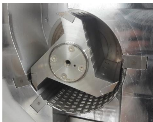
b) The size reduction chamber of the mill SM300.