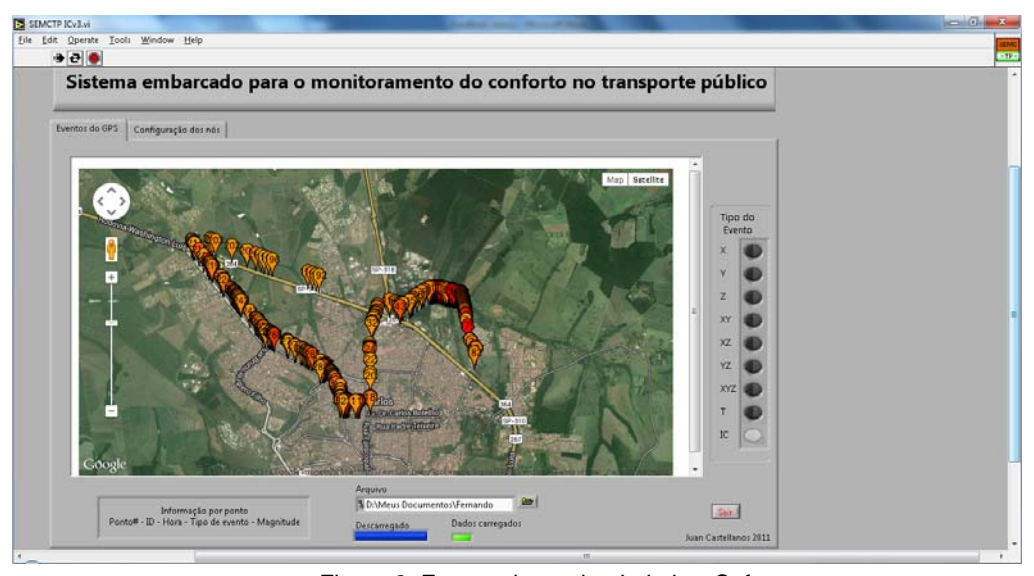
Figure 2: Events view using Labview Software

The data was analyzed using the described statistical methodology. For this review the charts of Figure 3 were generated. The test for comparing the sections was not performed for threshold violation with few number of occurrences, such as: for X axis for both equipment locations – middle and back; Y axis with the equipment located in the back; for X and Y axes in both equipment locations; X and Z in equipment located in the middle; and for Jerk with equipment located in the back. Comparing the frequency of event occurrences held in the trials using the chi-square test, the significant differences found are presented below.