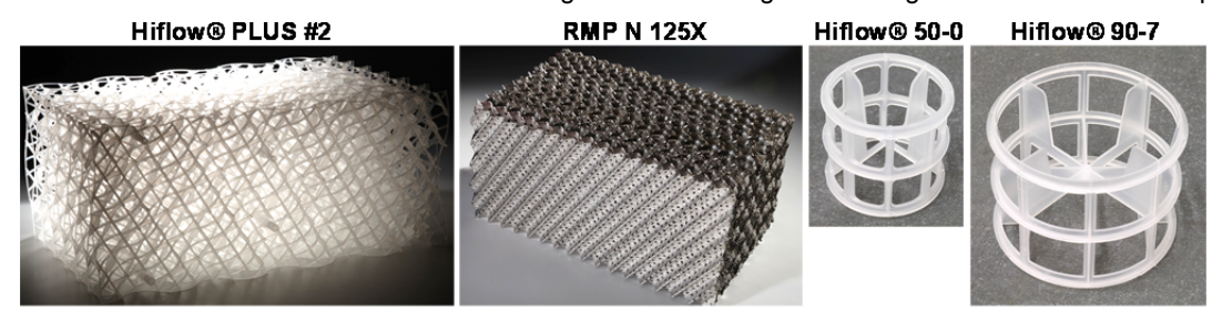
Figure 2: Packings considered for the cooling-condensing case study

Table 1 and Figure 2 show the types and main geometrical characteristics of the studied packings. Two plastic random packings, one metal structured packing and an hybrid plastic packing have been considered. All four packings are manufactured and commercialized by RVT Process Equipment GmbH in Steinwiesen (Germany). Since generally speaking mass and heat transfer is proportional to the geometrical (effective) packing area, the four packings chosen have been selected so that the specific surface area is in a similar absolute range around 100 m²/m³ (between 75 and 125 m²/m³). As a result, a fair comparative analysis of column size differences and investment costs can be performed. Furthermore, all four selected packings can be considered as low pressure drop-high capacity packings allowing performance up to high liquid and gas loads, typical in cooling-condensing processes. It is therefore that precisely these are the packing types and sizes that come into consideration for the design of such cooling-condensing towers in the industrial practice.