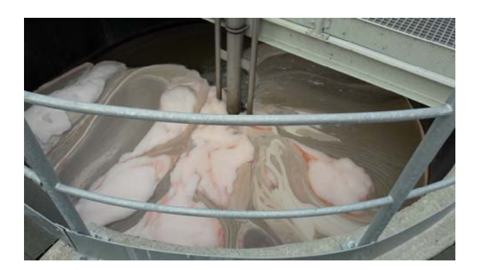
Figure 1: Firefighting foam captured in the wastewater treatment plant

This paper focuses on analysis of firewater runoff in chemical plant classified under the SEVESO Directive III. Lower-tier plant located in the north-east of Czech Republic was selected as a case study area for analysis of different scenarios considering firewater runoff with direct impact to the watercourse. A simple case study is performed, in order to provide the capability of the H&V Index methodology in the firewater runoff risk assessment.