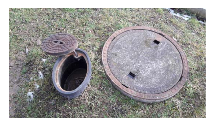
Figure 3: Safety valve for closure of rainwater sewerage system at the outflow to the river