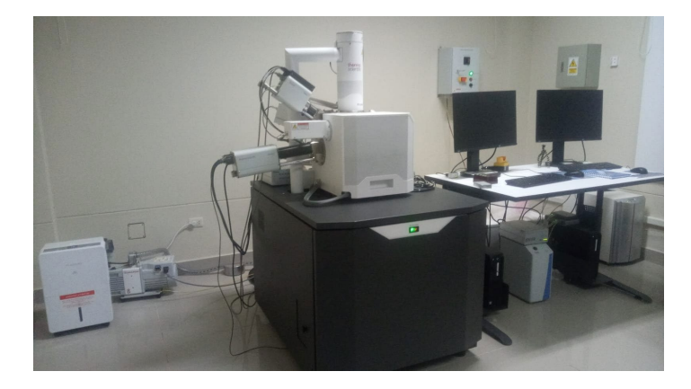
Figure 1: Thermo Fisher Scientific scanning electron microscope

The radish was harvested 30 days after planting. During harvest, leaf samples were taken from each treatment and taken for evaluation of the corresponding parameters. Soil, biol and foliar analyses were carried out at the National Institute for Agricultural Research (INIA) located in Huaral, Peru. Finally, stomatal density was determined using a Thermo Fisher Scientific scanning electron microscope at the National University José Faustino Sánchez Carrión (Figure 1).