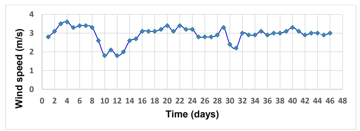
Figure 2: Measurement of average wind speed by days

With respect to the results obtained through the implementation of the wind-solar hybrid system in the rural community of Llanavilla, an average wind speed of 2.94 m/s and an average solar radiation of 297.76 W/m2 were obtained. Figure 2 shows the average values of the wind speed measurements obtained through the anemometer during the 45 days of the study, obtaining a maximum speed of 3.6 m/s and a minimum speed of 1.8 m/s.