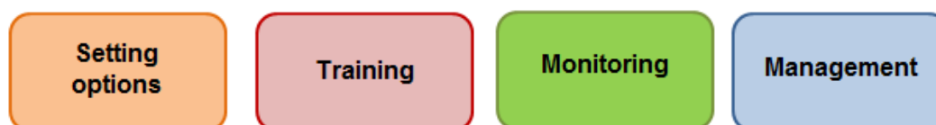
Figure 2: Operation modes

The measuring chamber has the main function of ensuring the reproducibility of the chemical conditions of the air to analyse and allowing the array of sensors the contact time needed to carry out the measurement. The chamber has an internal volume designed to optimize the response time of the installed sensors. Sixteen sensors in total are distributed on two horizontal levels, eight for each one: first level, sensors ID1.1 – 1.8; second level, sensors 2.1 – 2.8. Three different types of sensors are located in the measurement chamber: metal-oxide-semiconductor (MOS, n.14), photoionization detector (PID, n.1, ID1.8) and control sensor (temperature-humidity, n.1, ID2.8). The gaseous mixture, to be analysed, is introduced into the measuring chamber by a single-stage membrane pump, specific for gas, with a constant air flow equal to 300 ml min -1 . The management system is used to generate zero air and span air by using respectively an ozone system and a permeate tube. The zero air is used to clean the system, while the span air to verify the sensor signals. The IOMSartec software is designed to perform different operation modes (Figure 2) and allows to select and compare automatically different settings options, like the different feature extraction methods in the raw data pre-processing operation carried out to elaborate the odour monitoring model in terms of classification and quantification, for the training phase.