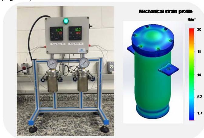
Figure 1: Scheme of the reaction system used in the step3. Mechanical strain and sprain profiles are presented

Step3: consists of a catalytic depolymerization of cellulose. The experiments were performed in a bench system, with two 300 mL stainless steel vessels, that have 70 mm internal diameter and 5 mm wall thickness (Figure 1).