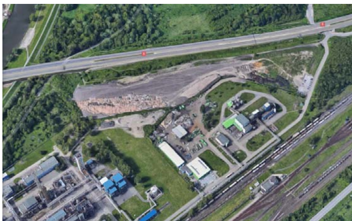
Figure 1: Location of the incinerator area and its surroundings

New SEVESO establishment, where hazardous wastes are stored and modified for purposes of their liquidation by combustion in the rotary kiln, was selected for purposes of this case study. The incinerator is designed for the safe disposal of hazardous wastes from industrial plants, allows the incineration of wastes of all states (see Figure 1). A characteristic feature of the industrial waste incineration process is the mixing of different types of waste to achieve the required combustion temperature (Silva and Lopes, 2017). Therefore, typical representatives of large amounts and most often imported hazardous wastes were selected.