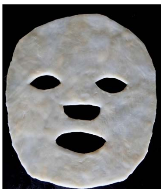
Figure 2: Prototype of the face mask made out of BC