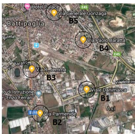
Figure 3. Air quality monitoring station network located in Battipaglia.