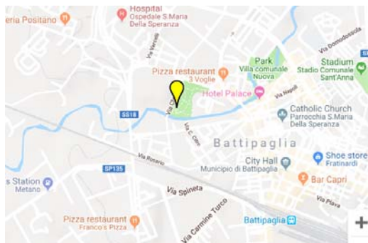
Figure 1. Location of the monitoring station of the Regional Agency for the Environmental Protection (ARPAC).

evaluate it or measuring the concentration of the pollutant. In this work, the urban background for the PM10 concentrations was evaluated using a monitoring station of the Regional Agency for the Environmental Protection (ARPAC). The ARPAC monitoring station is named as an urban-background station. In fact, it is located in a point (Figure 1) that is free from the influence of direct sources of local pollution. In this way the only type of pollution considered is carried by long distance transport mechanism and this value represents the fraction of pollutant not dependent from the modelled dispersion.