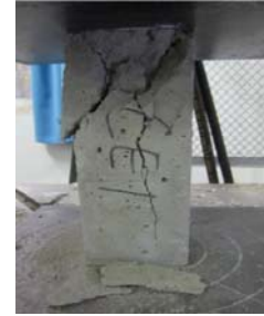
Figure 4: Testing Process of Combined Mortar(C)