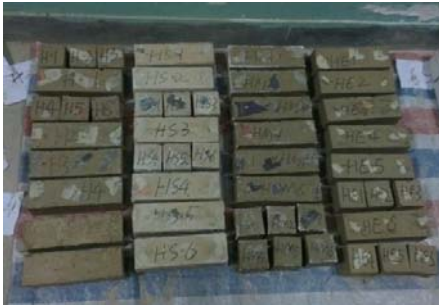
Figure 1: Preparation of Partial Cube and Prism Test Pieces in the Test

The size of specimen of mortar cube compressive strength is 70.7mm×70.7mm×70.7mm and the size of specimen of prismatic uniaxial compressive strength is 70.7mm×70.7mm×216mm. The specimen was numbered and demoulded after 2 days of rest, and maintained under natural conditions until the prescribed age of 28 days. Three different kinds of traditional masonry mortar have been produced. They are epoxy resin modified, methyl-methacrylate, sodium methyl silicate. The volume ratio of loess and quicklime in the mixed mortar is 8:2. The sifted loess and lime are mixed in proportion. After that, the mixed water is added to the mixed mortar, and the electric mixer is used to mix evenly for reserve. As the volume ratio of ash to soil in hemp mortar is 5:5, the sticky rice mortar is slowly added into water under stirring. After being slurried, it is mixed with the loess and mixed with an electric stirring device for reserve. As the volume ratio of lime to soil is 9:1, the sifted loess and raw lime are mixed in proportion, and then the mixed lime is mixed with mixing water. The mixture is evenly made into mud by electric stirring device. The volume ratio of lime-soil to hemp silk is about 100:6. Mix well and reserve.