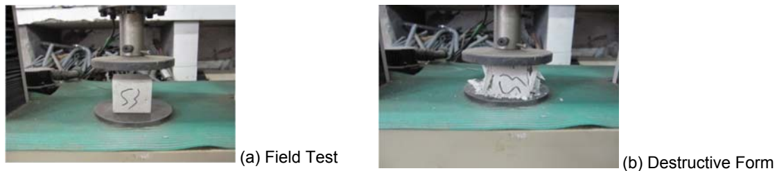
Figure 3: Sticky Rice Mortar (S) Substrate Test

Limited by length, only the test process of compressive test block of sticky rice mortar substrate cube is shown in Figure 3.