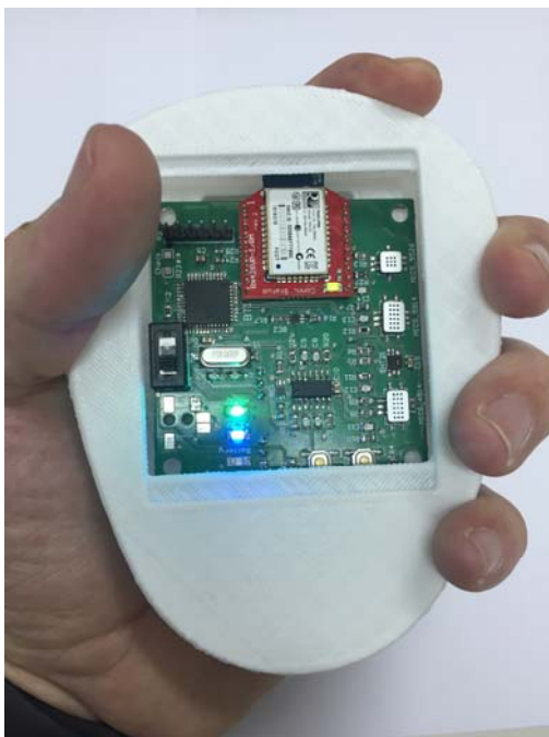
Figure 1: Prototype of the electronic nose

In any e-nose, data processing is a key part for odour recognition and classification, where different existing techniques are used. In particular, the relative resistance (RR) technique (Gardner, 1991) is used in the feature extraction phase of the sensor signals. To achieve a reduction of the dimension of the data, the principal component analysis (PCA) technique is used (Esbensen and Geladi, 2009), which is based on the expansion of Karhunen-Loeve (Kittler and Young, 1973). To implement algorithms for classification tasks, networks with Radial Basis Functions or probabilistic neural networks (PNN) have been used (Specht, 1990). Finally, leave-one-out cross-validation (LOOCV) have been used to determine the validity of the classification models with neural networks (Arlot and Celisse, 2010).