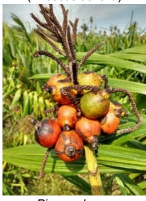
Piaçava brava (Barcella odora)