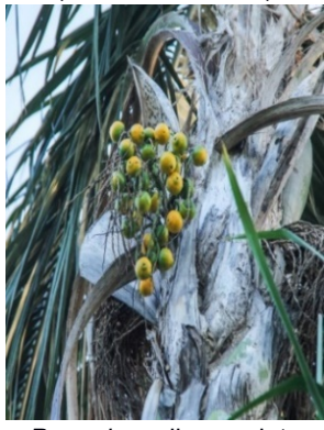
Pupunha yellow variety (Bactris gasipaes)