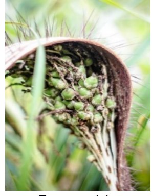
Tucumanzinho (Astrocaryum acaule)