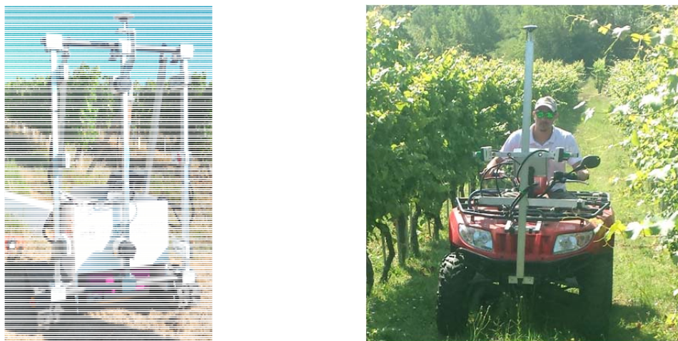
Figure 1: The left figure shows the ByeLab, while the right shows the operator during the crop monitoring operation using the ATV-Lab. The displacement speeds of the systems were set at 0.5 m/s and 2 m/s for the ByeLand and ATV-Lab, respectively. The middle NDVI sensors mounted on the ByeLab are installed at the same height on the NDVI sensor installed on ATV-Lab.

At the contrary, on the ATV-Lab were mounted only a couple of NDVI sensors, one for side, while it did not employed the LiDAR technology. Both sensors were mounted on a frontal support at an adjustable width and high. During the test, the sensors were placed at 0.3 m on the left and right side of the middle support and at a height of 0.9 m. These distances were chosen in order to monitor a representative portion of the canopy. At the top of the frontal support, the RTK-GNSS receiver was fixed. The sampling frequency acquisition was set at every 0.5 m of displacement. Besides, the ATV-Lab was also equipped with an on-board computer for the sensor controlling and management of the entire datasets acquired during the surveys (Figure 1).