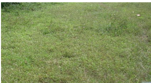
Figure 2: Grass ( Ischaemum pilosum Klein ex Willd.)