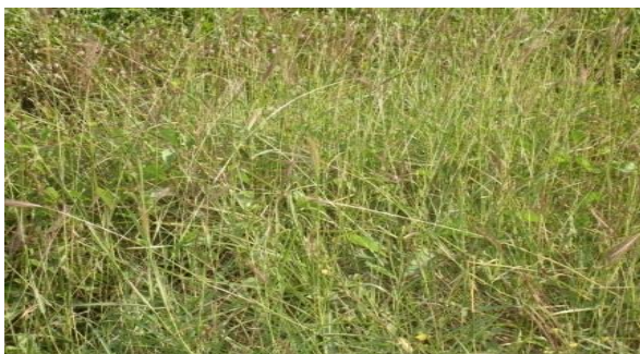
Figure 1: Grass ( Chloris barbata Sw.)