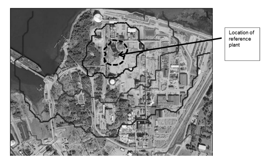
Figure 2: Individual risk contours for the design accident scenario, release of toxic gas. The dashed line represents 1.E-4 contour.

A reference plant was chosen, where both toxic and flammable materials were handled. The accident scenario that was believed having the greatest impact while work would be carried out was a break of a 2" pipe causing a toxic gas release. Figure 2 shows the individual risk contours for this scenario (Jacobsson, 2006).