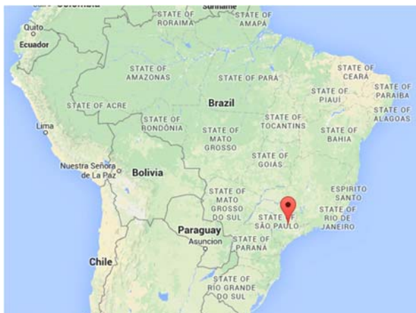
Figure 1: Location of Piracicaba, Brazil