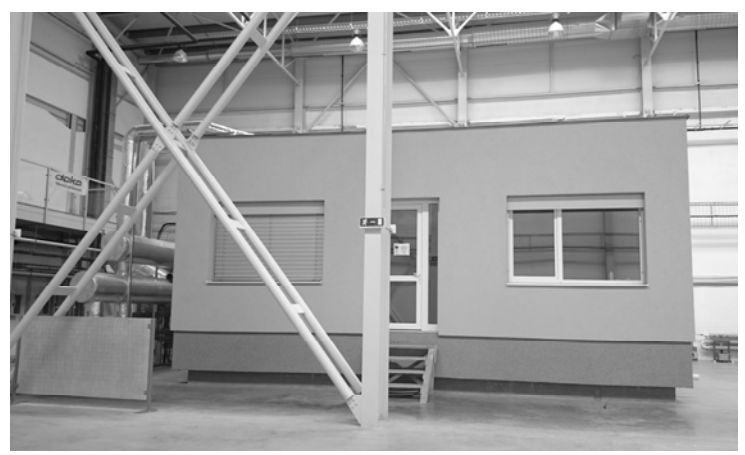
Figure 3 Model house in the laboratory

Two measurements of VOCs were carried out in this study. The first measurement was carried out in the model house and other in building of the laboratory, in which this model house was built. Both buildings are new and are located in campus of Technical University of Kosice. The model house consists from one room (the studied room), kitchen, bathroom with toilet and vestibule. In the studied room was applied laminate flooring, plastic window, ceiling from gypsum board, door fibreboard, lime-cement plaster and white interior paint. A partition is made of gypsum board; two exterior walls are made of bricks and one rear external from clay. At the time of measurement, the laboratory and even the studied room were still not fully equipped. Also the air conditioning unit in this room, which is located on the ceiling, was not functional (i.e. is ensured only natural ventilation currently) and the only furniture here were two older desks from fibreboard.