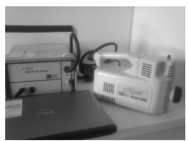
Figure 1 Electronic nose – zNose® 4300

In this study, a portable electronic nose, called the zNose® was used for qualitative determination of VOCs. The performance of this zNose® technology has been verified by the US EPA Environmental Technology Verification (ETV) program (Watson et al., 2003). This system is a small high-speed gas chromatograph (GC). It is based on a 6-port valve and oven, a pre-concentrating trap, a short GC capillary column (DB-5, 1 m length, film thickness 0.25 \mu m, internal diameter 0.25 mm) and a highly sensitive surface acoustic wave detector. A system controller, a laptop computer, operates the system, analyses the data and provides the user interface (Miresmailli, 2009). Accuracy of ±20% relative standard deviation is typical for GS/MS systems whereas manufacturer of zNose specifies the standard deviation <2% (Hites, 1997).