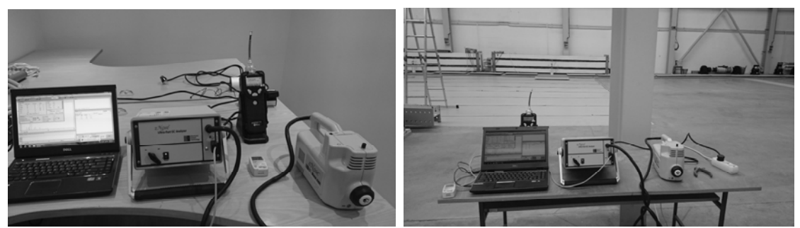
Figure 4 Measurements in the model house (left) and in the laboratory (right)

was used. Portable electronic nose – zNose® 4300 was used for qualitative determination of individual VOCs. The method used for this device includes the following settings: sensor temperature 10°C, column temperature 40-200°C, valve temperature 165°C, inlet temperature 200°C, pump time 60 seconds (0,5 mL of air/s), analysis time 20 seconds.