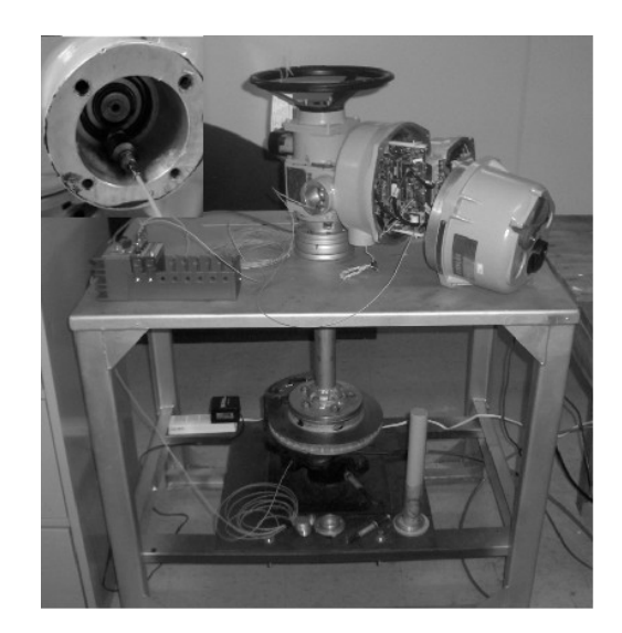
Figure 1. Test bench with CS06 actuator