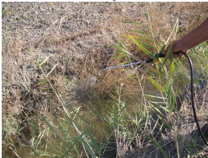
FIGURE 3 Large scale field test site

The tests have been carried out in two drainage canals in Metaponto plain (Basilicata Region - South of Italy). The test product was sprayed on the infested area and samples of water were collected before and after the treatment to measure the variation of concentration of mosquito diptera larvae (microscopic observation) versus time. Multiple samples are taken at each time to get statistically sound results (average and % Abbott test values are shown at the point 3). The results were compared with untreated controls on the same infested drainage canals