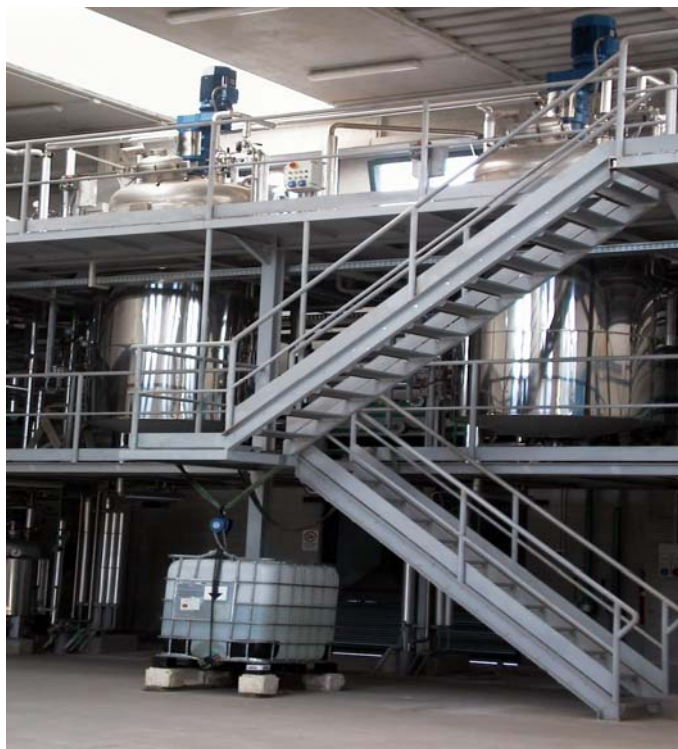
FIGURE 1 Bio & Geo Plant facility in Caserta

The production of experimental products has been developed by Bio & Geo S.r.l. in its laboratory and plants in Caserta (FIGURE 1), by fermenting the Bti z1 strain described above, recovering and drying the parasporal crystals (Technical Powder: TP) and than formulating these crystals as emulsifiable liquid concentrate (Formulate: FO), with the addition of protective ingredients and surfactants to enable easy mixing with water for an application as a spray on large areas.