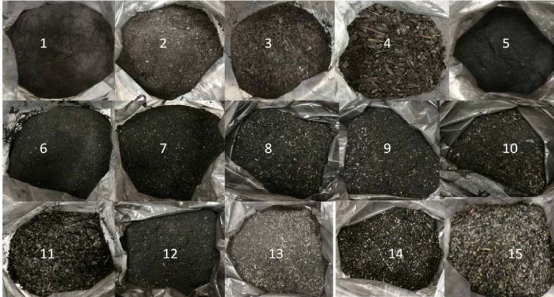
Figure 2: Mixtures used in the pelletization tests

through the pelletizing machine producing a sort of powder. When the moisture of the mixture was enough to produce the pellet the yield of pellet, given by the ratio between the pellet produced and the 400 grams used as input material was about 40%w/w. This means that about 60%w/w in weight of the used mixture remained inside the pelletizing machine.