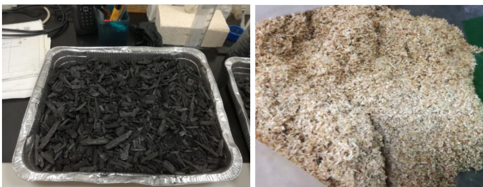
Figure 1: Raw materials used in the pelletization tests: biochar (left) and sawdust (right)

The material has been taken from the IPRP pilot plant (Integrated Pyrolysis Regenerated Plant) designed and realized at the university of Perugia and described in previous works (Bartocci et al. 2016). Pelletizing tests have been performed at the Laboratories of the Biomass Research Centre, University of Perugia using biochar produced from local biomasses. Design of Experiment was implemented in the software Minitab 17. Fifteen pelletization tests have been performed with mixtures of biocarbon, sawdust and water in different proportions. The pelletization tests have been based on a Box-Behnken scheme with three factors (saw dust ratio, moisture ratio and biochar size), three levels and three central points. The parameter to optimize was the final durability of the obtained pellet. The pelletizing machine used in the tests is produced by Smartec and the model is PLT 100. The main features are the following: 40 kg/h product mass flow, 6 mm pellet diameter, 4 kWe engine power, 100 kg machine weight. In this work about 10 kg of biochar was taken from the IPRP plant in Terni, Italy. Sawdust was used as an additive (see Figure 1).