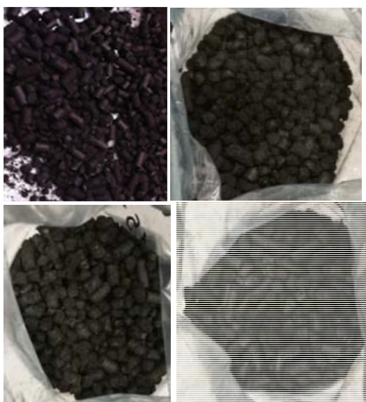
Figure 3: Obtained pellet from test 3 (up-left), test 6 (up-right), test 11 (down-left) and test 14 (down-right)

The explanation for the results shown in Table 3 is that on one hand the biocarbon needed water to aggregate and form pellet with an acceptable mechanical strength; on the other hand too high moisture content in the pellet resulted in bad cohesion. Hence there is an optimal moisture content to grant good durability. The content of water in the raw material influences also the temperature of the die. If the temperature of the die is too high the compression force needed to produce the pellet decreases and so decreases also the durability of the pellet. It was found that during the tests it is highly recommended to start with high moisture content of the mixture (to avoid the heating of the die) and to recycle the material in the output for 5 to 10 times to decrease its moisture gradually and obtain good mechanical strength of the material.