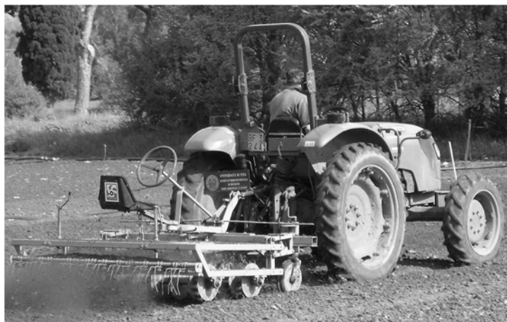
Figure 1: Rolling harrow at work before crop planting

The flaming machines control weeds by the use of an open flame. In these experiments they were equipped with 25 or 50 cm wide rod burners, for a total working width ranging from 1.5 m (in carrot and garlic) and 2 m (in fennel) (Figure 2). This treatment has the advantage of eliminating weeds without stimulating new emergence, because the soil remains undisturbed. The machine is equipped with common 15 kg LPG tanks placed into an on purpose made hopper (Peruzzi et al., 2007). Furthermore, these machines are also equipped with an innovative heat exchange system, in order to avoid thanks cooling during the flaming treatment (due to the LPG passage from liquid into gaseous phase). It consists in heating the water contained into the hopper utilizing the emissions coming from the tractor exhaust head.