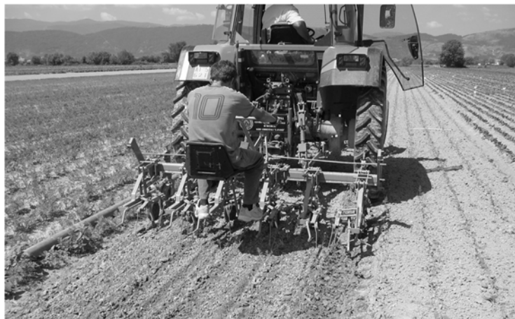
Figure 3: Precision hoe at work in fennel

The precision hoeing machine is characterized by a 2 m wide frame and was equipped with 6 rigid elements for inter-row cultivation (a central “foot-goose” tool and two side “L” shaped sweeps or discs) and elastic elements for intra-row selective weed control (torsion weeders and vibrating tines) and a guidance system consisting in a seat, steering handles and directional wheels (Figure 3). The vibrating tines, which work in vertical position, have their longer segment bent at several points in order to till very close to the crop row (Peruzzi et al., 2007). The torsion weeders, on the other hand, work in horizontal position; a torsion spring enables the tines to flex when they meet a fairly developed plant (generally a crop plant but it could also be a large weed) that opposes resistance to the implement action (Peruzzi et al., 2008a). The position of both tools can be modified according to the treatment aggressiveness required. Treatment becomes more intense when the tines are positioned close to the row crop. The inter-row distance was set to 0.45 m for fennel and 0.20 m for carrot and garlic. Average working speed was about 2 km h -1 and working depth was about 4 cm (Peruzzi et al., 2008b).