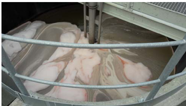
Figure 1: Firefighting foam captured in the wastewater treatment plant

This paper focuses on analysis of firewater runoff in chemical plant classified under the SEVESO Directive III. Lower-tier plant located in the north-east of Czech Republic was selected as a case study area for analysis of different scenarios considering firewater runoff with direct impact to the watercourse. A simple case study is performed, in order to provide the capability of the H&V Index methodology in the firewater runoff risk assessment.