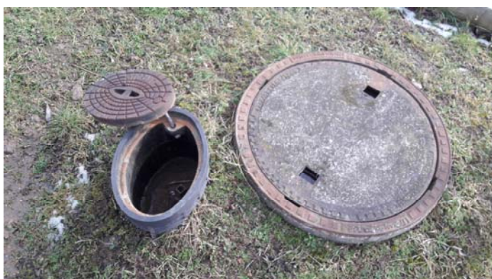
Figure 3: Safety valve for closure of rainwater sewerage system at the outflow to the river