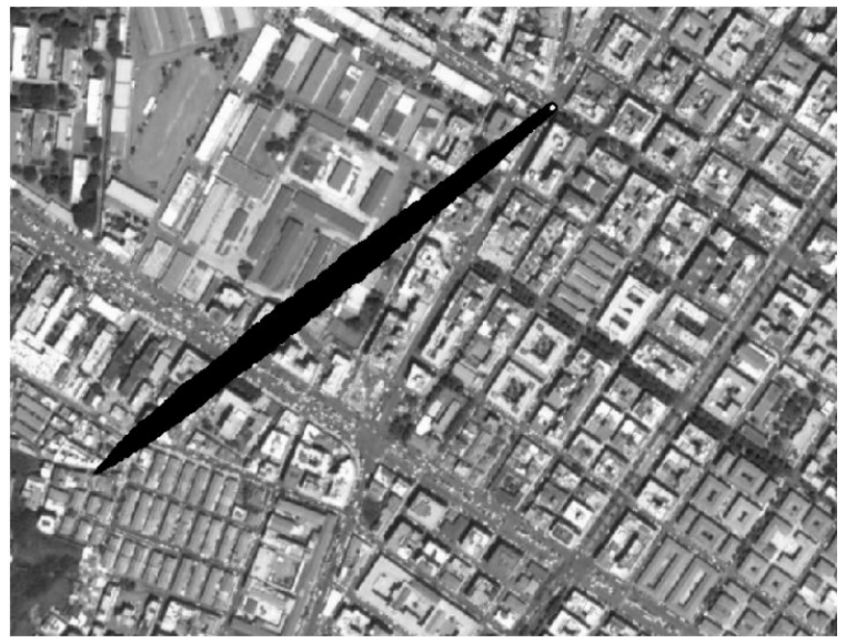
Fig. 4. An image of the dynamic simulation.

Concerning the case-study, Lisi et al. 2007 have produced the effects map for a dispersion of chlorine. In this work, using a GIS tool developed in our laboratory, it has been possible to have a dynamic description of the time evolution of the plume generated by the incident and as a consequence the determination of damage area as a function of time. This kind of dynamic effects map can constitute an important source of information for those who have to enact specific emergency civil defence plans and, moreover, also for those who have to apply protection and/or mitigation measures for the exposed population. Figure 4 shows an image of the dynamic simulation of a catastrophic release of chlorine due to the explosion of a road tanker in an urban area (case-study).