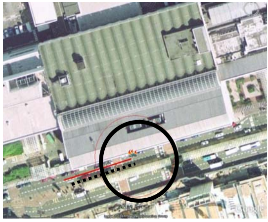
Fig. 3. Map of of the consequences of the attack.