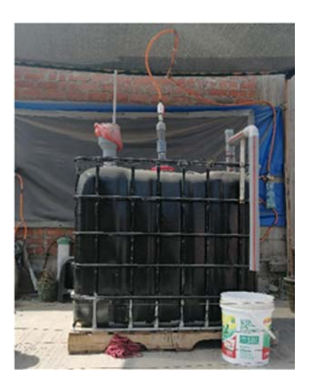
Figure 2: IBC bioreactor

Biomass mixture: The first feed to the biodigester was 1000 L of water, then 233 L of manure-water mixture (58.8 Kg of manure and 175 L of water) were recharged, 6 times per week at each feed (Figure 2).