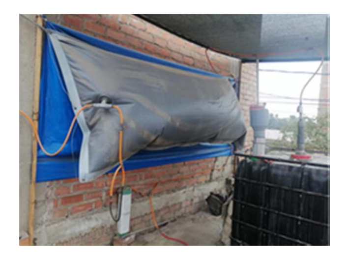
Figure 3. Biogas bag and gasometer