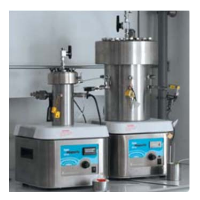
Picture 2. Pictures of Phi-Tech I (a), ARSST (left) and VSP II (right) (b).