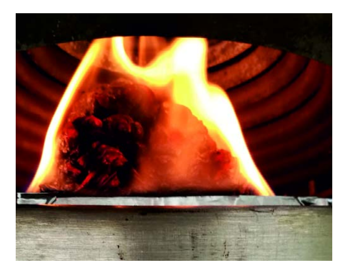
Figure 2: Swollen char layer formed on the surface of myo-inositol sample.

As a result of analysis of maltitol's HRR, it can be concluded that the initial increase of the HRR is being followed by a slow growth up to the maximum value. The first stage it the ignition of flammable pyrolysis products while the second stage is limited by the rate of decomposition and the emission of combustible products into the combustion zone. Due to high molecular weight and contribution of functional groups, maltitol shows the highest HRR, THR and TSR values. Maltitol, does not caramelize, therefore it generates large amount of soot as a result of incomplete combustion. Myo-inositol is characterized by very short TTI. It also shows low HRR, and its flaming phase is statistically longer then for the rest of the tested compounds. Such behaviour is characteristic for compounds with the ability to generate a swollen char on the surface of the sample, see figure 2.