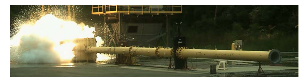
Figure 4: Mechanical explosion isolation of an aluminium dust (KSt = 450 bar m/s) deflagration initiated in a 5-m3 vented vessel (Taveau, 2017)