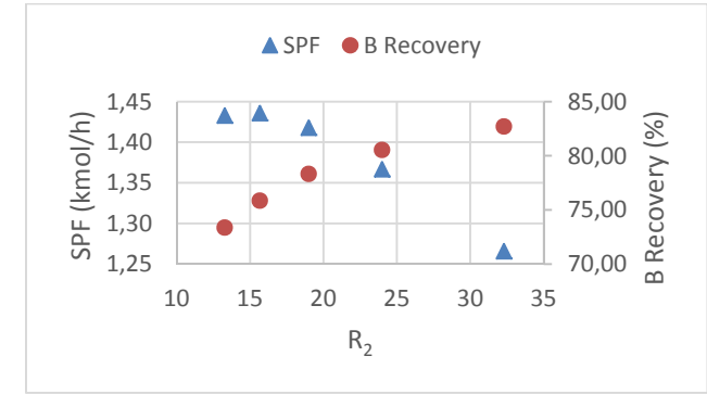
Figure 2: The influence of R_2 on the B recovery and SPF (Strategy A, \Delta U_{ch}^E =0.64 kmol).

1, so the C-content of the still cannot be decreased significantly, therefore more C must be removed in Steps 1b and 2, which means higher B-loss and a decrease in \eta_B . When Cr is lower than 1 vol%, the duration of Step 1b is shorter, than at higher Cr values, which means that less E-rich phase is removed. Consequently, more E remains in the still, so more distillate must be withdrawn in Step 2, which means higher B-loss.