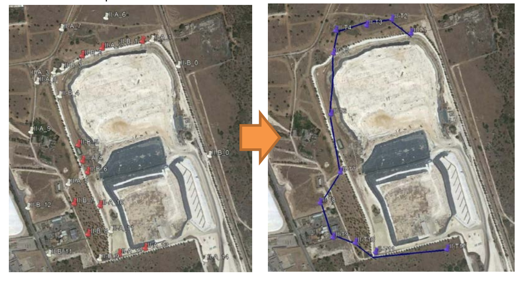
Figure 2: Example of map of the plume extent limits resulting from the II measurement cycle

On the contrary, the comparison of the model simulations based on a constant SOER shows a better correspondence between model outputs and field assessments, in terms both of shape and extension of the determined odour plume extents.