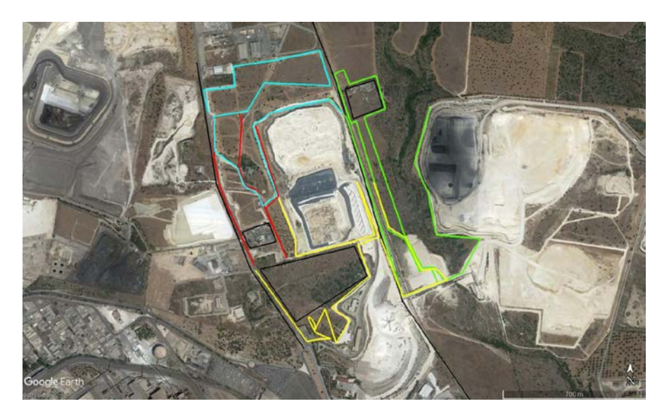
Figure 1: Map of the studied landfill and the surrounding paths (coloured) identified for the field inspection. The black lines indicate the limits of inaccessible areas (private properties or other plants)

A preliminary inspection survey was organized inside the landfill and in the surrounding areas in order to map the investigation area and trace the paths that could be covered by the panel members for the identification of the presence of odours from the studied landfill (Figure 1).