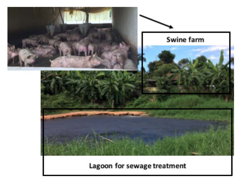
Figure 1: Sewage collection and treatment of a small swine farm in southeast of Brazil

the environmental impacts generated by improper waste disposition and generates an extra income for the farmers, in additional to provide improvement on sanitary standards in rural areas (Oliveira et al., 2011).