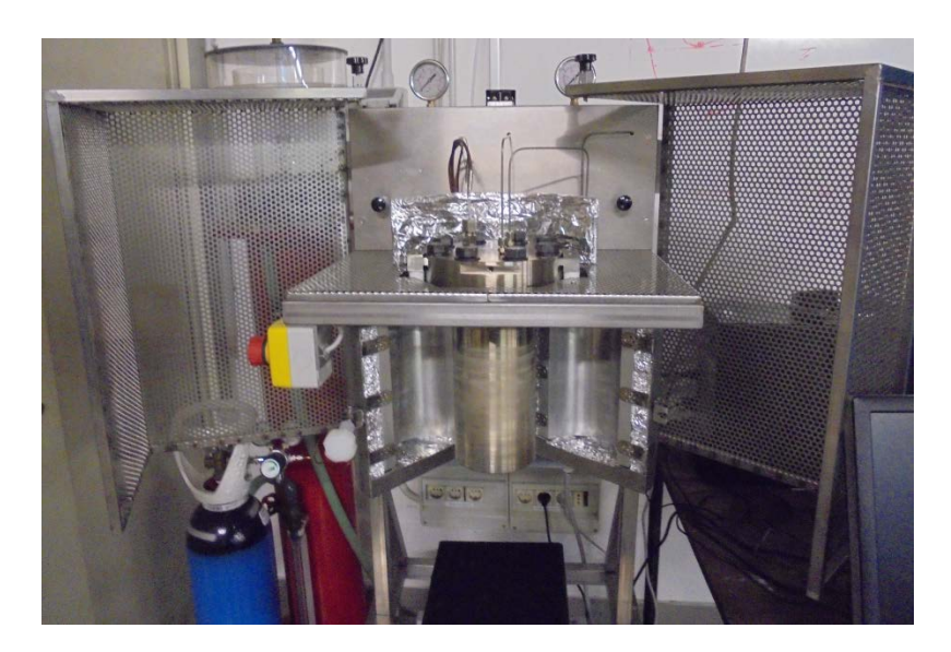
Figure 2: HTC reactor.

The shells are equipped with mechanical hinges: during the test (heating phase and constant temperature phase) the shells are tightened on the reactor; once the test is over, the shells are opened to allow the reactor to cool down. Figure 2 shows the reactor with the shells in open position. An electric power meter allows monitoring and recording the electrical consumption during HTC trials: though this measure, data concerning the heat of reaction could be inferred.