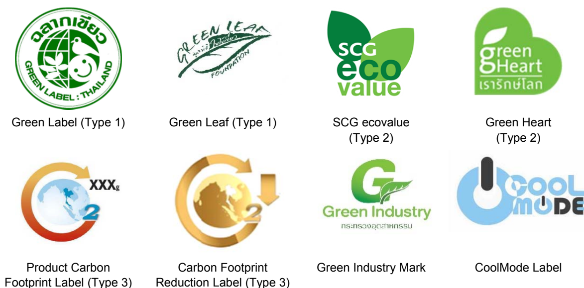
Figure 1: Examples of some prominent labels in Thailand

Carbon footprint labels have been developed by the Thailand Greenhouse Gas Management Organisation (2017) (Public Organisation) (TGO): carbon footprint (assessing the life cycle GHG emissions expressed as carbon score), carbon footprint reduction (assessing the carbon footprint reduction within 2 years by 2 % of the total carbon footprint), carbon neutral (offsetting the carbon footprint totally to become zero emissions), and CoolMode (using fiber technology to provide the textile structure to be cool, comfortable and easy to clean) (The Thailand Greenhouse Gas Management Organisation, 2017).