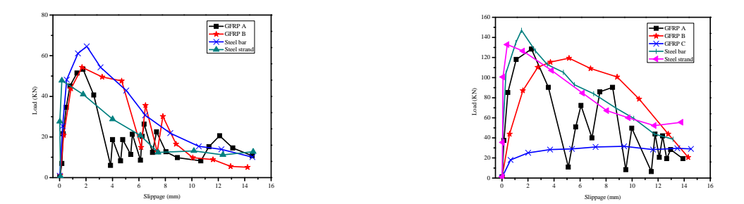
Figure 2: Pull-out test load - slip performance of GFRP anchor rod and steel anchor rod in anchor length of 63.5mm concrete block and Pull-out test load - slip performance of GFRP anchor rod and steel anchor rod in anchor length of 127mm concrete block

In the formula, P is the load; A is the cross-sectional area; E is the elastic modulus; S is the distance from the top of the bond length to the LVDT (micrometre) measurement points or micrometre.