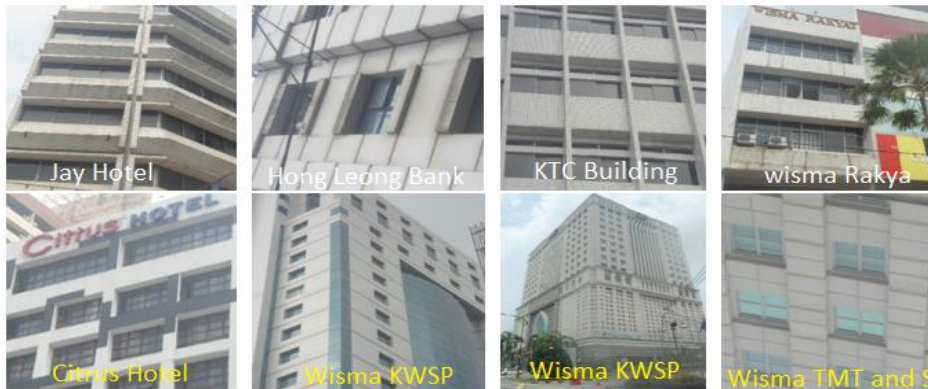
Figure 4: Photographic comparison of RWF buildings in Johor Bahru Malaysia

As observed in Table 2, three of the selected buildings are oriented to the south. The architect's design may have opted this orientation to shade the Sun at South solstice and reduce unwanted solar gain. In effect, this will help capture adequate daylight to decrease lighting energy load of the building. Conversely, the RWF of the remaining four buildings is inclined to the east which according to the US DoE makes it harder to control sun angles, glare and solar heat gain (US Energy Information Administration, 2015). Figure 4 presents photos of the RWF of the selected buildings in Johor Bahru, Malaysia. Figure 4 clearly illustrates the degrees of thermal performance of each glazing type in buildings. The reflecting glazing shows the greater rejection of heat penetration compares to other two glazing types by blocking 68 % of solar transmission into the building. The absorbent or tinted glazing performed moderately by shielding the building from the effect of solar radiation by 59 %; although there is a likelihood of rerelease of some absorbed one into the interior, despite that, clear glazing performed very poorly by intercepting solar radiation by only 10 %. This performance shows the weak nature of the clear glazing in building design for passive cooling. Conversely, clear glazing is recommended in passive heating and can also be used in the north side orientation.