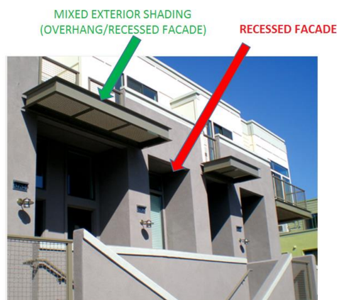
Figure 1: Mixed exterior shading strategies

Figure 1 presents an example of provision of shade using mixed shading, inclusive of recessed wall façade for optimum shading to cool buildings. The deployment and integration of the outlined sustainable design practices can potentially reduce the energy demand for cooling and ventilation in Malaysian buildings. There is limited research on recess window facades (RWF), their applications and effects on cooling and ventilation on energy in Malaysian buildings. The study will present the results of an exploratory survey of recessed window shading facade in selected buildings in Johor Bahru, Malaysia. The findings of the study will assist architects, engineers and policy makers in the design of more energy efficient, low emission and thermally comfortable buildings for the future.