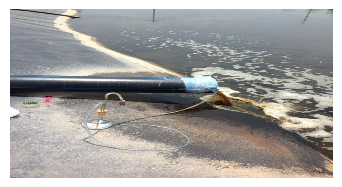
Figure 1: Gas sample collection from the end of a leachate pipe at the semi-aerobic sanitary landfill site.

driven through the cork stopper. The funnel was placed over portions of the leachate collection ponds from where gas was seen bubbling (Figure 3), gas pressure was allowed to build up within the funnel for 24 h and then slowly filled the gas sampling bag. The collected gas was characterized to ascertain its constituent composition.