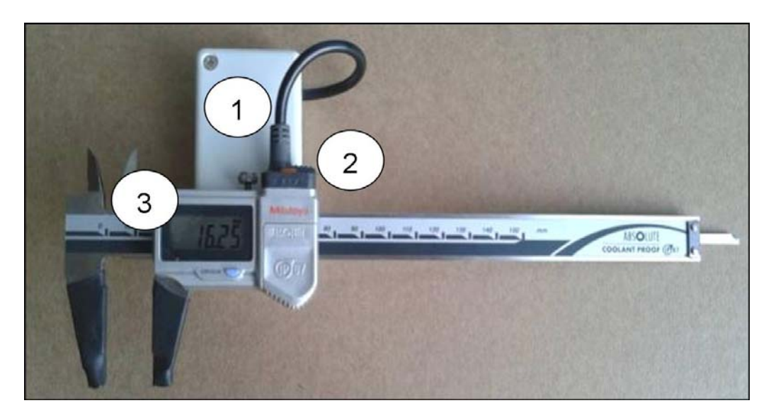
Figure 2. Digital Caliper with onboard datalogger (Calibit). 1Datalogger; 2Recording Button; 3 Data display

where W is the fruit weight in grams, D is the fruit diameter expressed in millimetre and a and b are parameters specific to Pink Lady<sup>®</sup>. These parameters were obtained in 2007 by regressing diameter and weight data from a large number of fruit picked during the whole season; the R<sup>2</sup> of the relationship was > 0.99. The same equation allows forecasting fruit distribution in size class categories both in percentage (table 2) and t/ha (table 3). This was done according to the commercial standards, which increase by 5 mm, starting from 65 mm to 90 mm, was also assessed (table 2 and 3). The data for this paper was analysed comparing predicted values with real orchard production data using as a variate the different years applying respectively the glimmix procedure and a Mixed model analysis. Crop load was assessed by fruit counts on the last measurement performed in August, following the protocol described by Manfrini et al. (2009). The crop load (number fruit/tree) was 106, 160, 67, 161, from 2010 to 2013 respectively. The multiplication between the expected fruit size at harvest obtained in the last measurement prediction (table 1), the crop load and the tree density, permit predicting the orchard production of the current year (table 2).