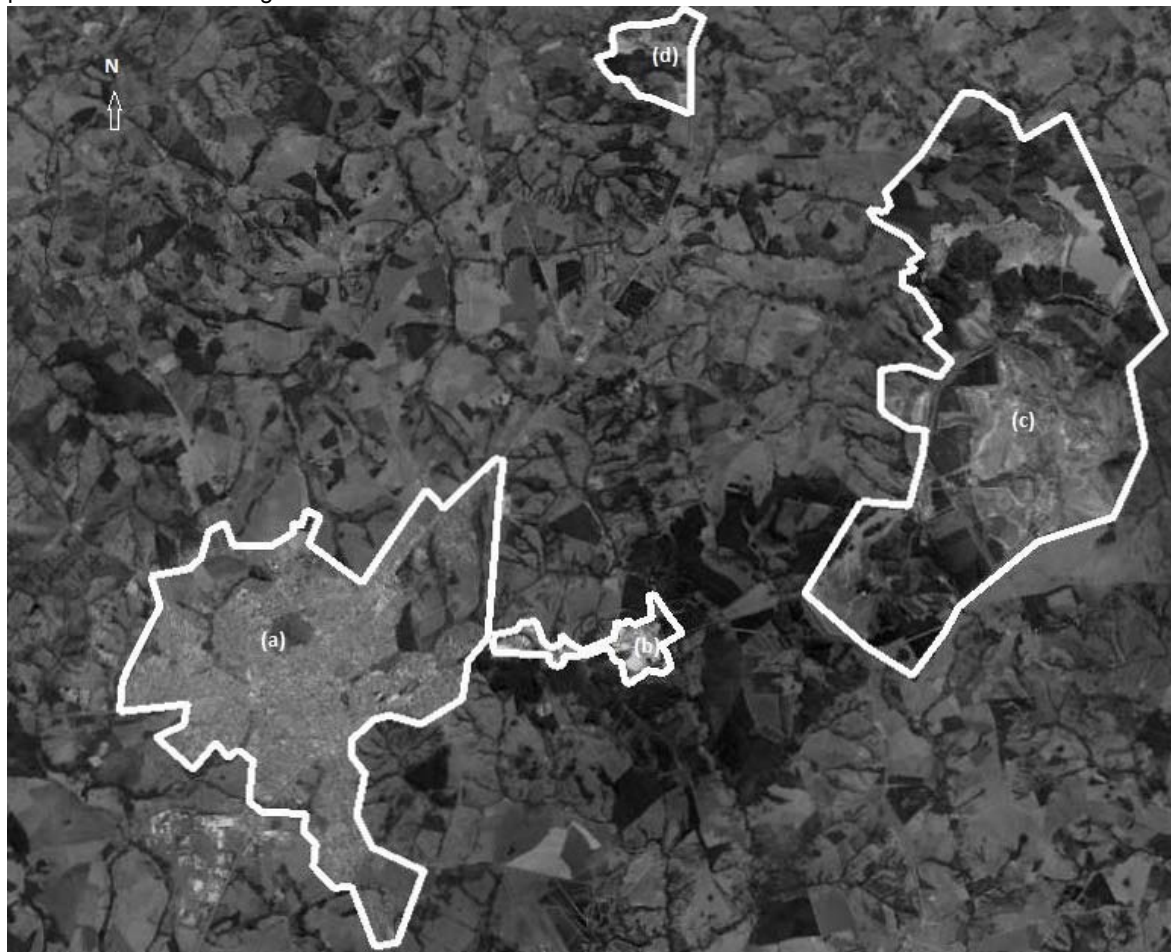
Figure 1: Aerial view of Catalão area. Urban area (a), Phosphates fertilizer plants (b), Catalão Mine I (c) and Catalão Mine II (d).

agency (BRASIL, 1990) was also sampled. All filters (glass fiber), were gravimetrically analyzed before and after sampling with a \pm 2.700 mg microbalance in order to determine the amount of collected particulate matter. Sampling conditions and mass concentrations are shown in Figure 2. The filters were stored under sterile Petri dishes dried in 50 °C for two hours before characterization. Following an integrated procedure of characterization and identification of the particulate matter using non-destructive analytical techniques. Characterization of the particles (chemistry) was performed using a fluorescence spectrometer for energy dispersive X-ray (EDX 7000, Shimadzu). Because there is no Brazilian legislation on air quality for particulate matter size less than 2.5 \mu\text{m} , we opted to keep all the discussion of this work only for the relevant parameters present in the current legislation.