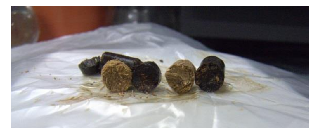
Figure 2: Palm pellet (light brown – left) vs. Energy Pack (dark brown – right) – after waste engine oil absorption to inner layer of pellet

From Figure 1, a maximum of 18 wt% of waste oil is absorbed by the pellet for 100 g sample; whilst, 20 wt% of waste oil is absorbed by the pellet for 50 g sample. This value may be increased if pellet with higher porosity is employed and full penetration of oil through the inner part of pellet is observed. In contrast, the amount of oil that is absorbed can diminish if highly dense pellet is used and the oil absorption time of the pellet will be prolonged to achieve equilibrium. Nevertheless, oil absorption into pellet is fast that equilibrium is almost achieved within 2 minutes in an environment of excess oil.