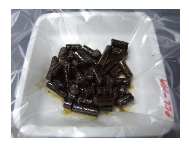
Figure 3(b): Energy Pack – palm pellet after waste oil absorption