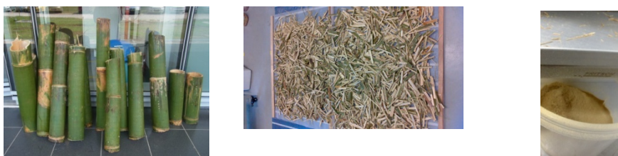
Figure 1. Bamboo; raw, open air drying and grinded samples (200-500 µm) (left to right)

Samples of Gigantochloa scortechinii was harvested from Tasik Banding Gerik, Perak Darul Ridzuan (estimated age was over 3 years) and its culm was used for this study. The bottom and top of the bamboo was removed prior to cutting into 1 m length. These culms were washed for any contamination and debris (such as fungi or sand). The bamboos obtained have culm size 15 cm diameter and 80 cm height. Then woody stem of bamboo was further cut to small size, approximately 7cm × 1cm × 1 cm (Figure 1). The samples were further dry in an open air to dry the surface of bamboo (air dry) for overnight and oven at 105 °C for 24 h to get less than 10 % moisture (approximately 5 %). The dry samples were ground into homogeneous particle to pass through 250 µm (low speed granulator to reduce size from flake to less than 4 mm; mill pulverizer to produce powder of 250 µm). Then, samples were stored in air-tight container for next step pyrolyze and analyses.