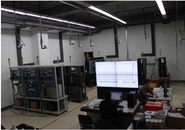
Figure 1: The reliability laboratory and the device of the CNC system

A CNC-SRT laboratory has been established in Beihang University. Because failure analysis is based on a large number of fault data, 30 sets of CNC system have been selected to observe and then extract the fault data related to the CNC system. The reliability laboratory of the CNC device and the detection system of the reliability test are shown in Figure 1.