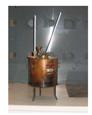
Figure 2: View of INERIS manual Abel closed-cup flash point apparatus

The experimental parameters prescribed are the following: