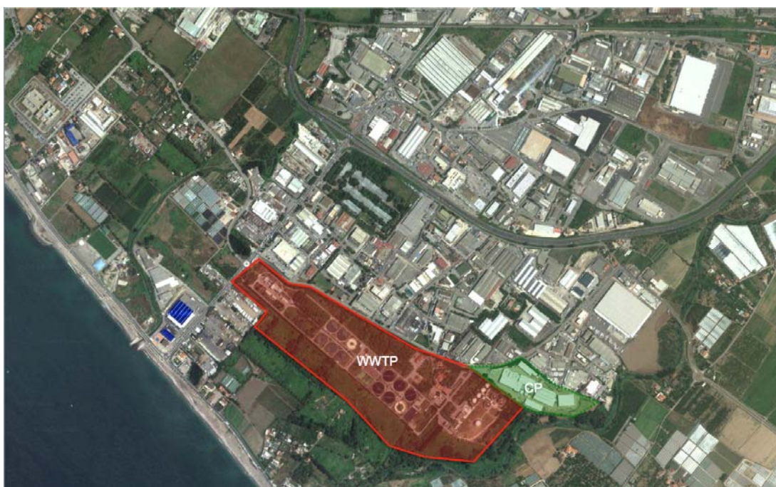
Figure 1: Industrial area of Salerno city (Italy) with the localization of the studied plants: wastewater treatment plant (WWTP) and Composting Plant (CP)

WWTP is biological plant based on conventional activated sludge for 700,000 pe. CP treats a organic fraction of MSW of all Salerno City with an Anaerobic/Aerobic process where odour emission are treated by Scrubbers and then by Biofilters.