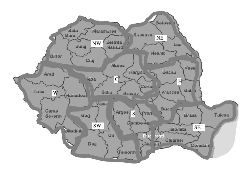
Figure 4: Regions of project implementation: North-East (NE), North-West (NW), West (W), South-West (SW), South (S), South-East (SE), East (E) and Center (C)