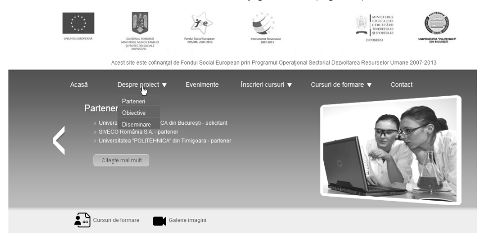
Figure 1: Portal menus

The project portal was designed and developed with two major components: an educational platform, AeL, created by Siveco and further refined by a continuous feed-back from all participants, and an enrolling and information structure split into several useful modules: an accounting system, electronic forms and automatically generated files, a scheduling section, a versatile database containing all applicants and able to generate various statistics. The portal public zone contains the menus: Home/Acasă , About the project/Despre proiect, Events/Evenimente, Courses enrolling/Înscrieri cursuri, Training courses/Cursuri de formare, Contact/Contact. The main page ( Home/Acasă ) is shown in Figure 1, having the background menu selected. The portal private zone, accessible by user name/nume utilizator and password/parola , allows the applicants to enroll in the training program ( Courses enrolling/Înscrieri cursuri menu). The login section is shown in Figure 2. As an applicant fills in the fields in Personal data/Date personale submenu and saves an electronic form, the Enrolling forms/Formulare de înscriere are automatically generated (Figure 3).